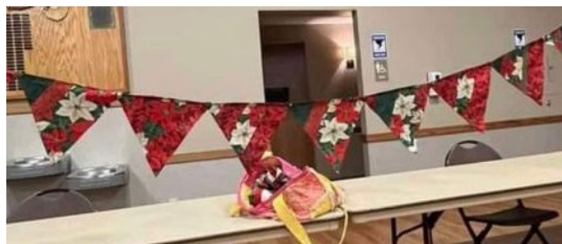
Another Christmas Tree block idea from Madaline