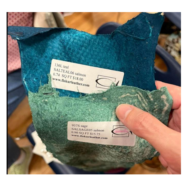
1 - The fish leather Ann shared at Sew & Tell

That varies. I am currently into orange and of course purple.