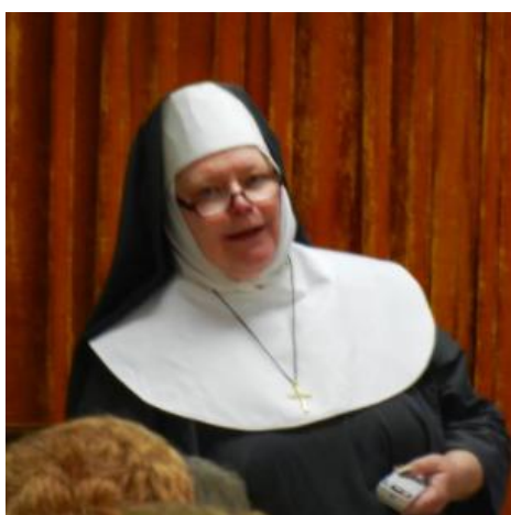
Sister Sew n Sew