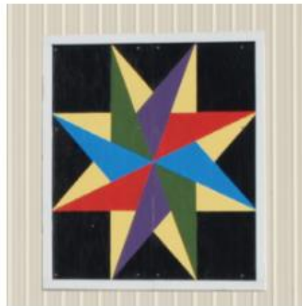
8-Point Star- Southern Trail

Details at: http://dekalbcountycvb.com/dekalbcountybarnquilts/